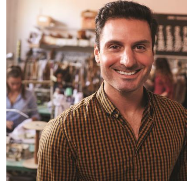
In 2018, membership reaches 206,500