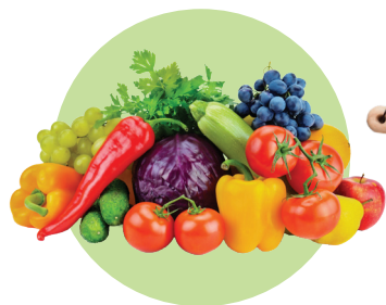
Fruits and vegetables