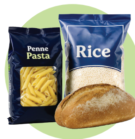
Healthy grains— bread, cereals, pastas, rice, etc.